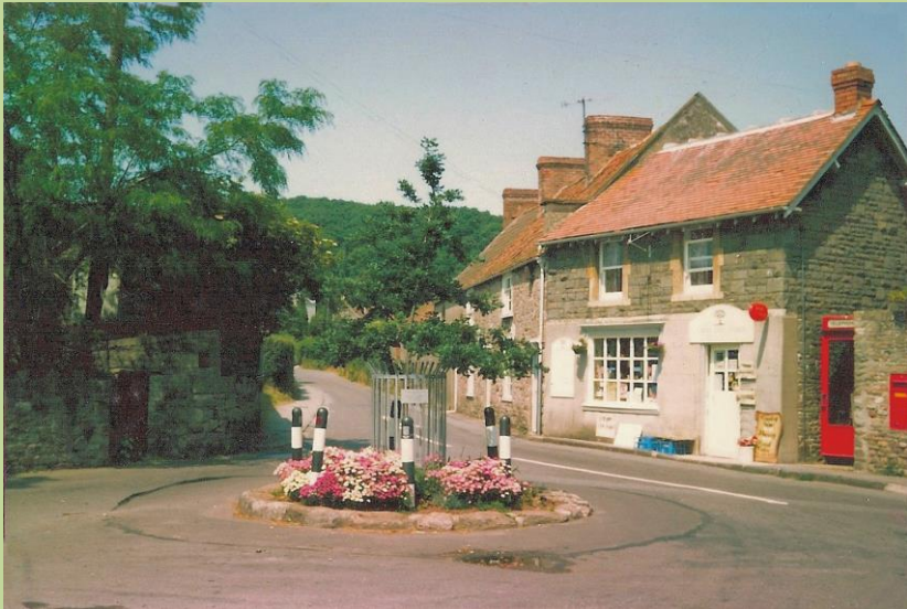
Cross Tree Stores (c1983)